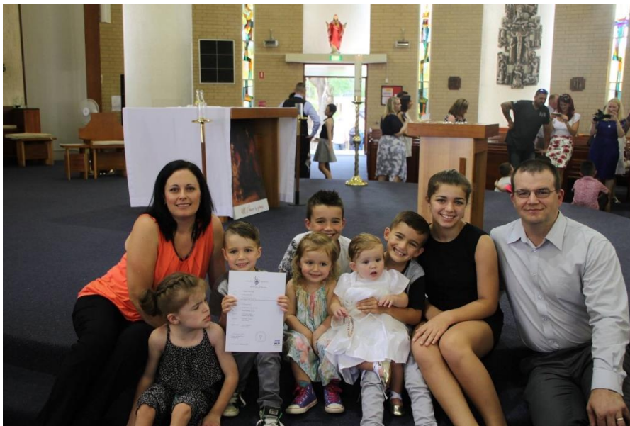
Photograph of Torah's family.